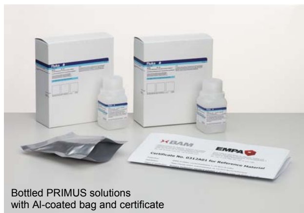
Bottled PRIMUS solutions with Al-coated bag and certificate

«PRIMUS» stands for Primary Multi-Ion Standards and is a joint project of EMPA, Fluka GmbH and Metrohm whereby BAM (Federal Institute for Materials Research and Testing) acts as a partner institute for certification. The standards are prepared gravimetrically based on the kilogram as one of the seven basic SI-units. In gravimetric production the quality of the original substances used is of crucial importance. This is why a dual approach has been selected for the certification of the primary materials for PRIMUS: as many as possible of the trace impurities in the primary materials are quantified or their non-existence is demonstrated (below detection limit). This involves the analysis of up to 85 parameters per substance including cations, anions and non-metals. Residual water is eliminated by drying temperatures up to 500 °C and the successful completion of the drying process is checked by TGA (TGA = thermogravimetric analysis).