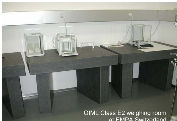
OIML Class E2 weighing room at EMPA Switzerland

Weighing out the primary materials as well as the 50 liter batch is carried out on high-precision balances from Mettler-Toledo in an air-conditioned weighing room (OIML class E2). The primary materials are dissolved in ultrapure water or diluted high-purity HCl in specially manufactured PVDF containers and then mixed for 12 hours in an overhead shaker.