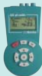
826 pH mobile