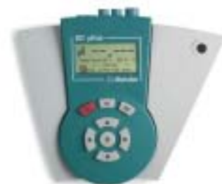
827 pH lab